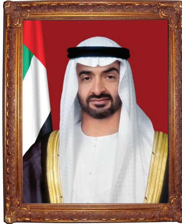
H.H General Sheikh Mohammed Bin Zayed Al Nahyan Crown Prince of Abu Dhabi Deputy Supreme Commander of the UAE, Armed Forces