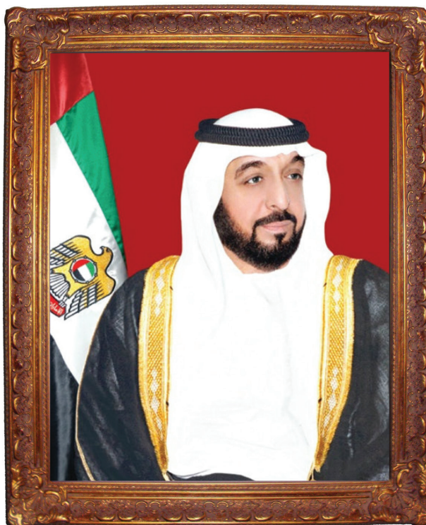
H.H Sheikh Khalifa Bin Zayed Al Nahyan President of United Arab Emirates