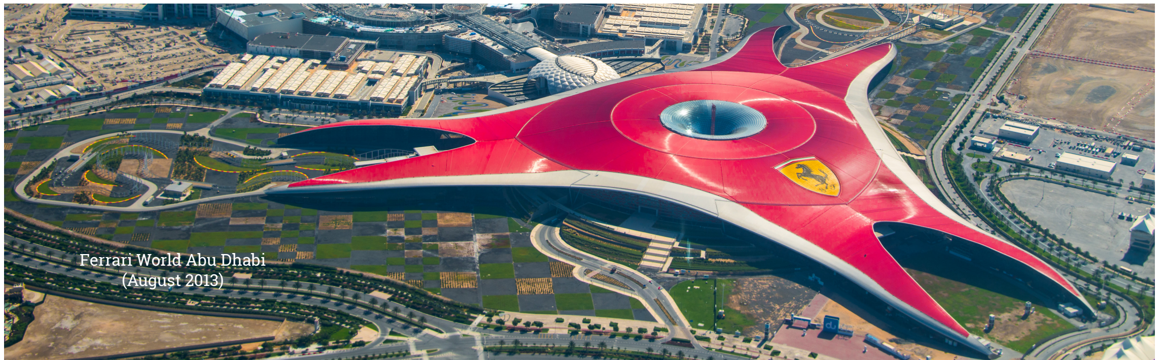
Ferrari World Abu Dhabi (August 2013)