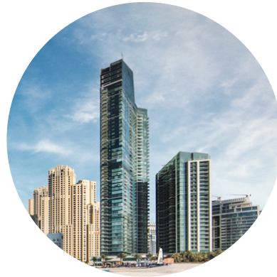
Al Bateen Residence, Dubai (November 2013)