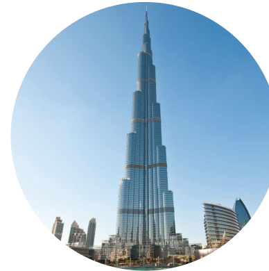
Burj Khalifa, Dubai (April 2013)