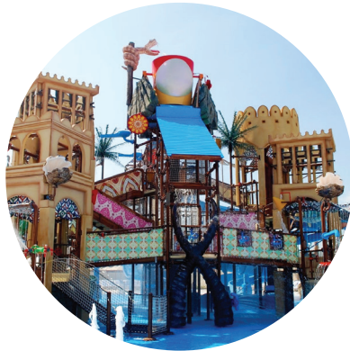
Yas Water world, Abu Dhabi (August 2013)