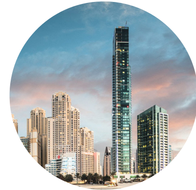
Al Ain Properties